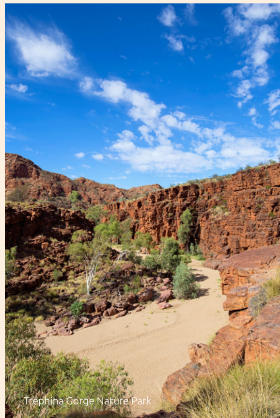
Trephina Gorge Nature Park

Applicants should note details of successful funding recipients will be advised publicly and recorded in the Department of Tourism and Hospitalitys annual report and Tourism and Events NT website.