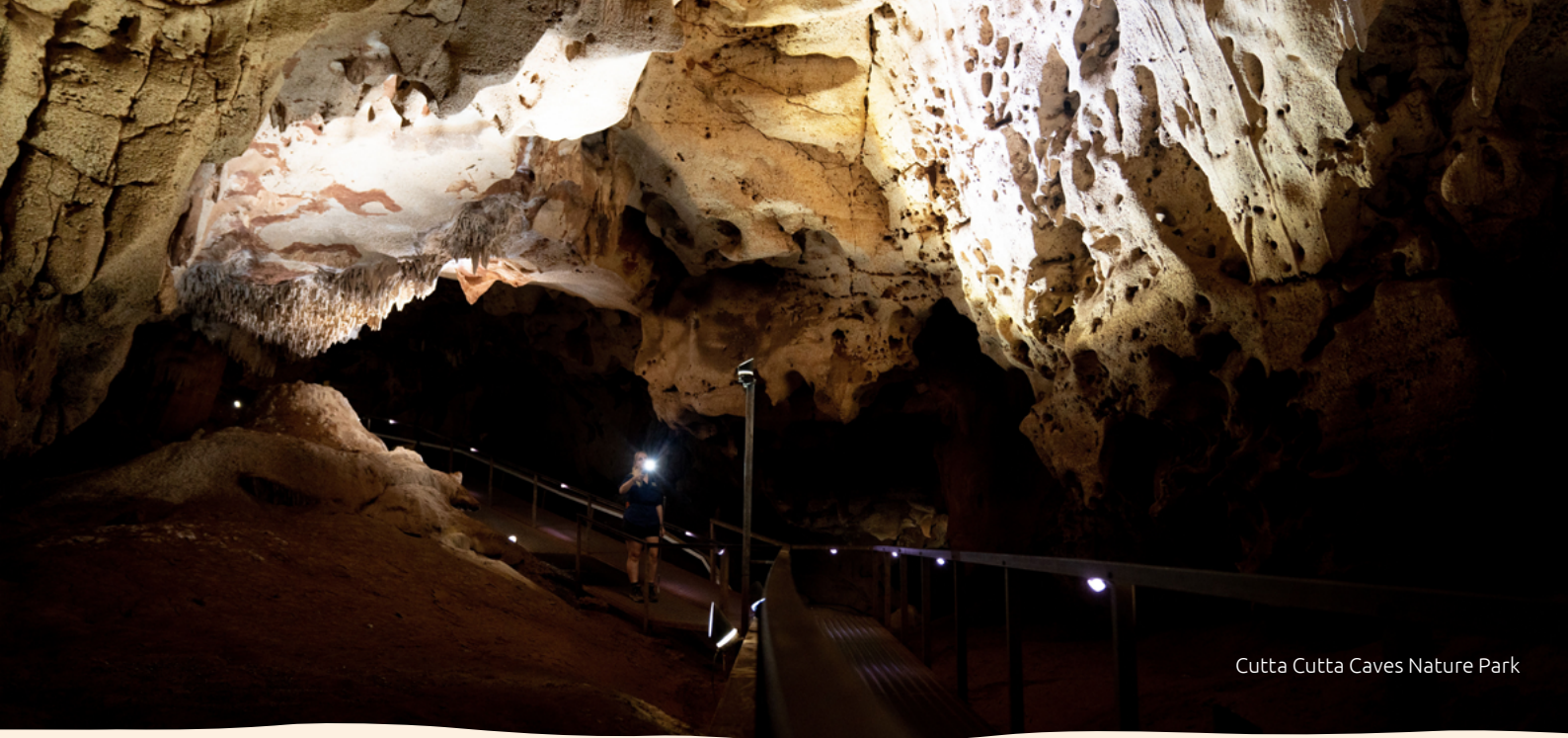
Cutta Cutta Caves Nature Park