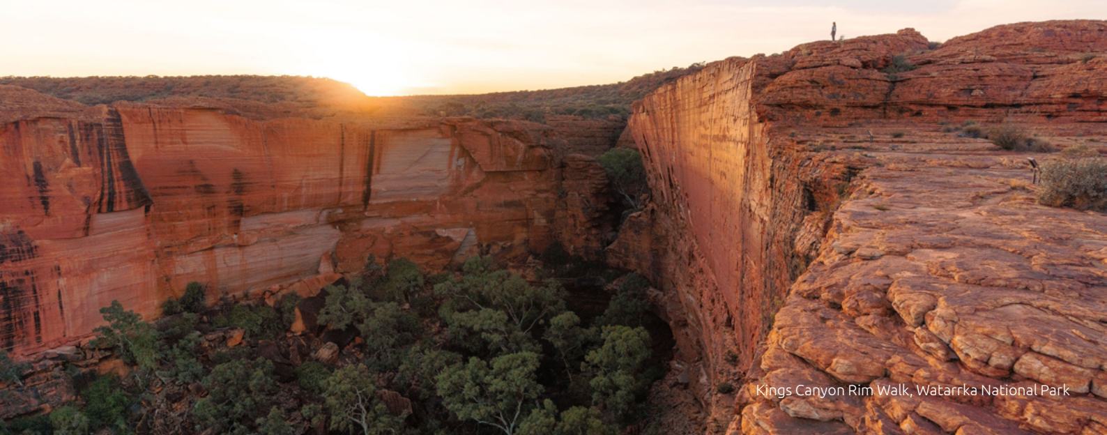
Kings Canyon Rim Walk, Watarrka National Park