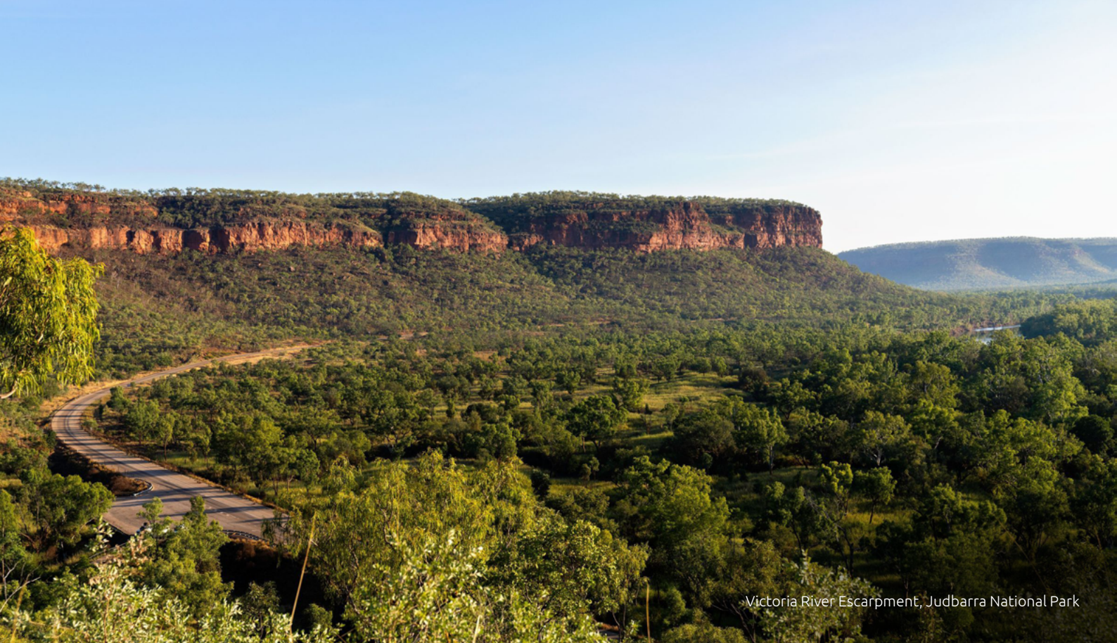
Victoria River Escarpment, Judbarra National Park