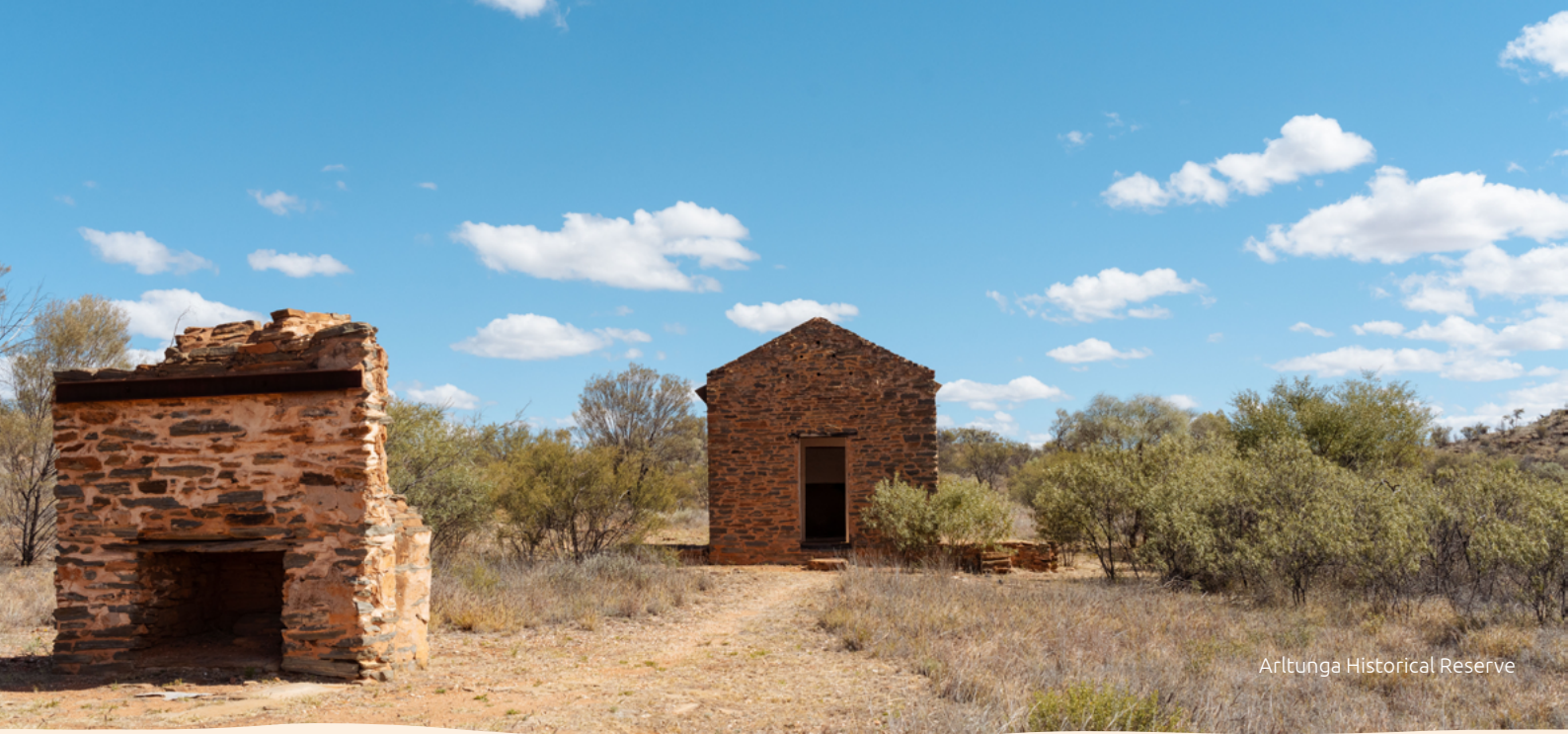
Arltunga Historical Reserve